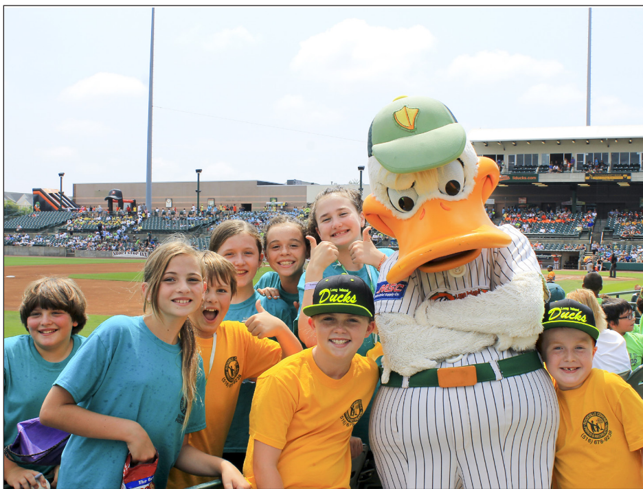
With a variety of activities and trips planned, the Summer Program is sure to be a blast this summer. Call the Recreation Center for detailed information.