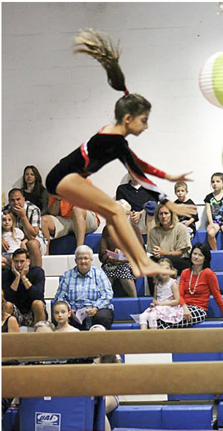
Come down for the 40th annual gymnastics shows on May 29th, 30th, and 31st.

The Har-Tru courts, adjacent to the Recreation Center, 111 North Oceanside Road, are ready for play. The courts are open from 8 a.m. until dusk, seven days a week. Admission is by valid recreation card, plus court fee.